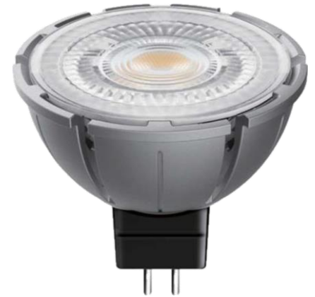
Dimensional Drawings (mm)